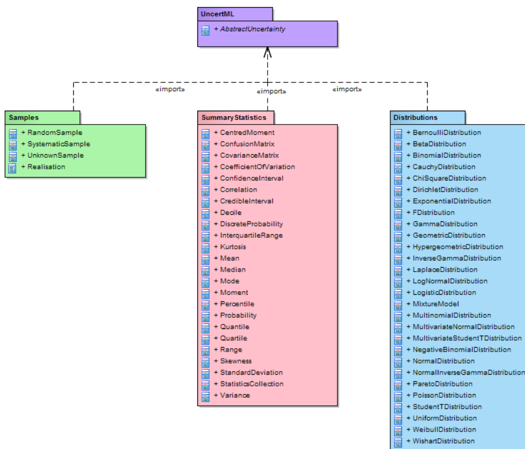
Figure 2 – UncertML 2.0 conceptual model

For the sake of generality, we allow for multiple URIs: this could support the expression of compound UncertML concepts (although this use-case is probably not so relevant, within the current version of the UncertML dictionary).